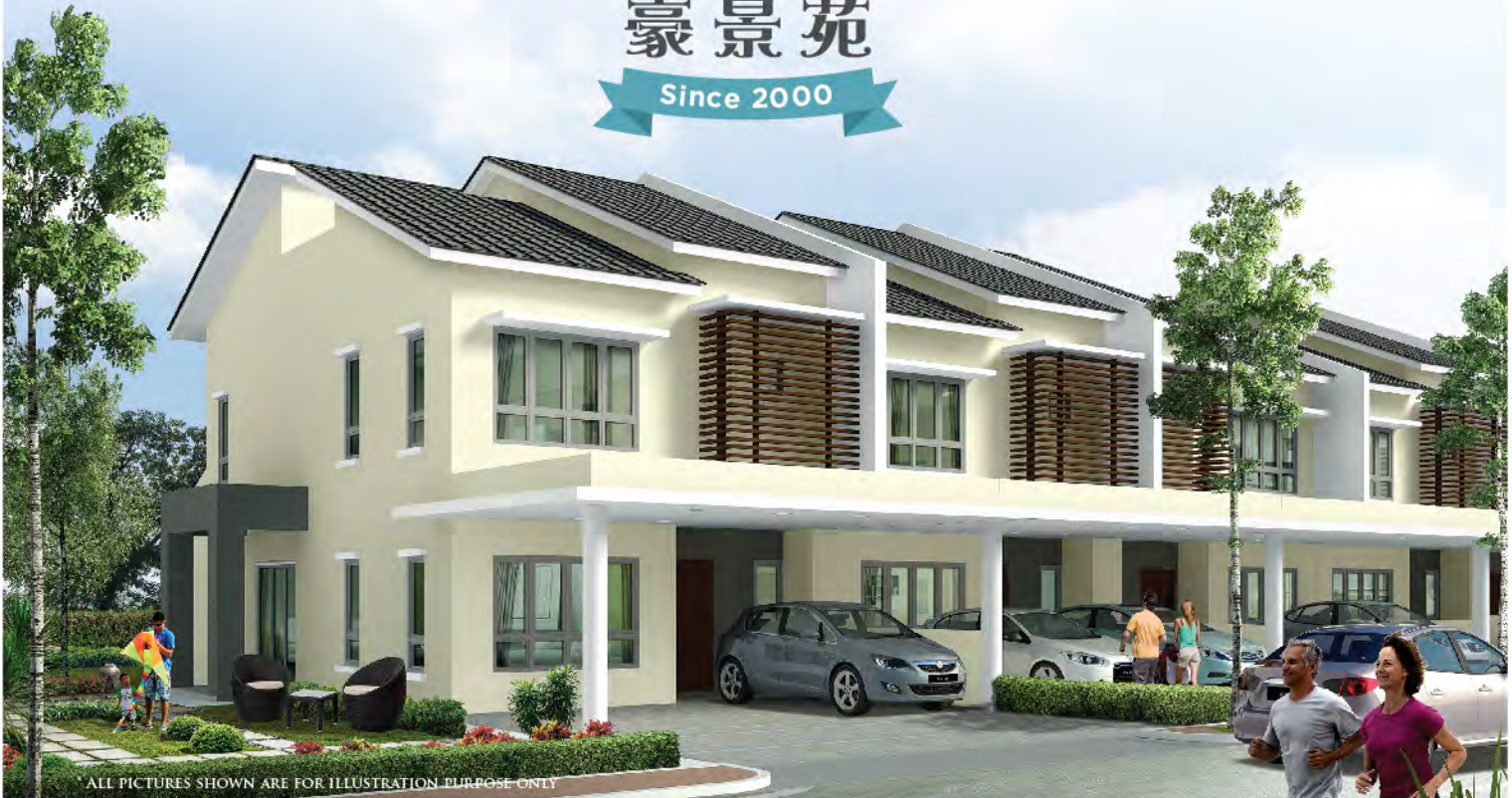
ALL PICTURES SHOWN ARE FOR ILLUSTRATION PURPOSE ONLY

46 UNITS • DOUBLE STOREY TERRACE HOUSE • 22' X 62'